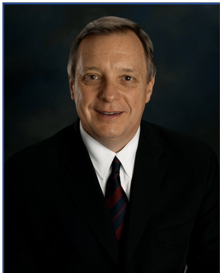
SEN. DICK DURBIN