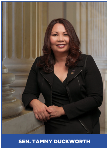
SEN. TAMMY DUCKWORTH