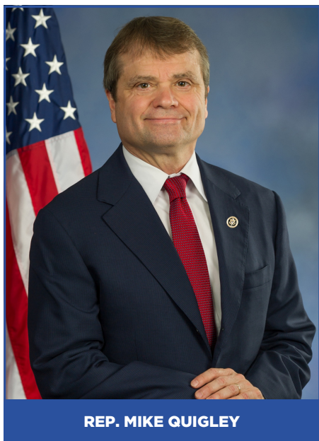
REP. MIKE QUIGLEY