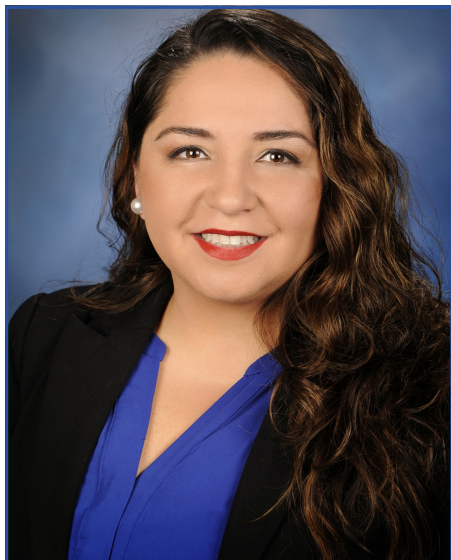
REP. DELIA C. RAMIREZ