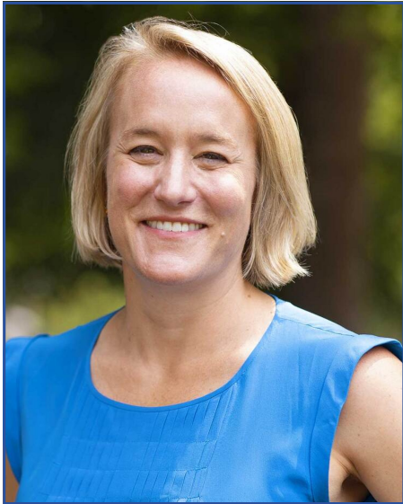
REP. NIKKI BUDZINSKI University of Illinois System Alum