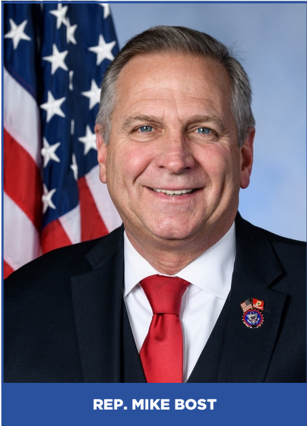
REP. MIKE BOST