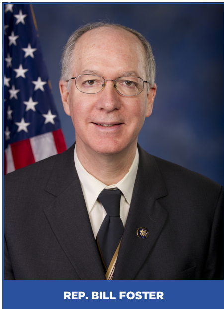
REP. BILL FOSTER