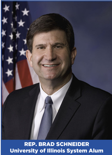
REP. BRAD SCHNEIDER University of Illinois System Alum